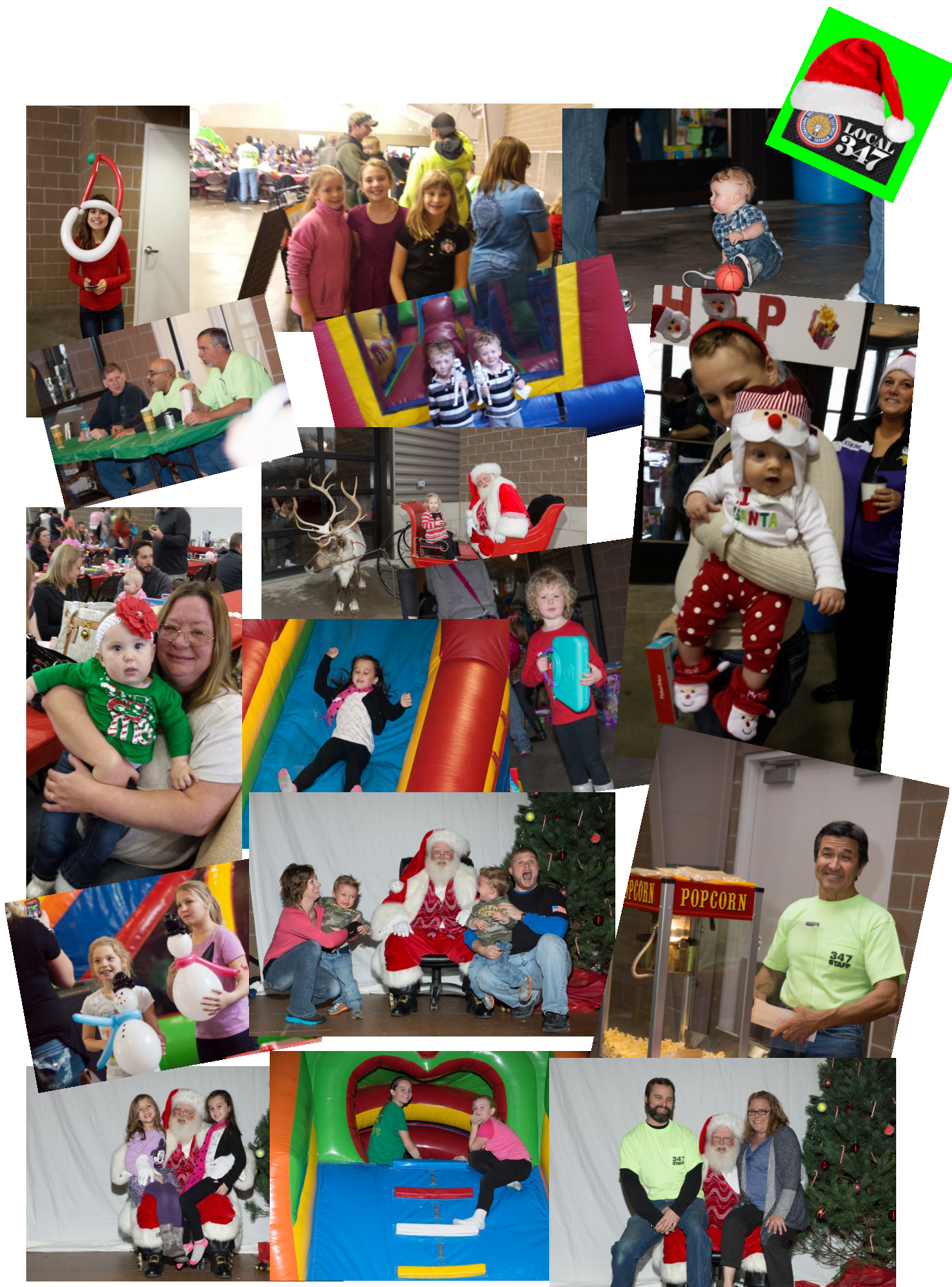
2014 Children's Christmas Party