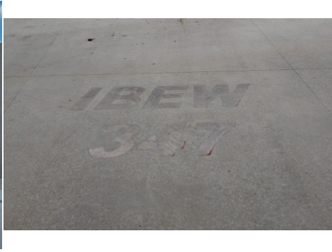
NEW UNION HALL PROGRESS